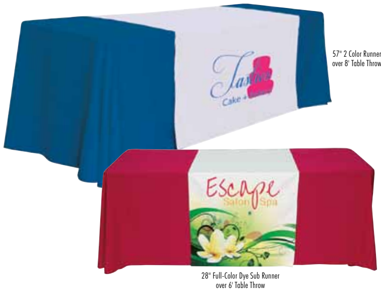
57" 2 Color Runner over 8' Table Throw