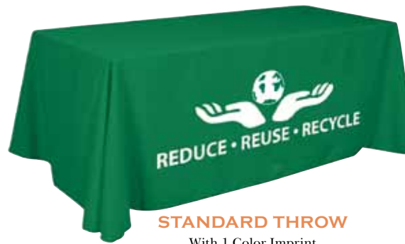
STANDARD THROW With 1 Color Imprint