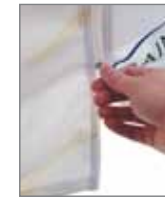
Zipper allows throw to be loose enough for installation and fully taut when complete