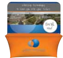
Over The Top Backwall shown on 8' UltraFit Table Throw