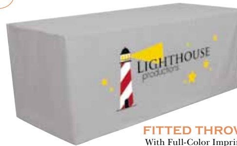
FITTED THROW With Full-Color Imprint