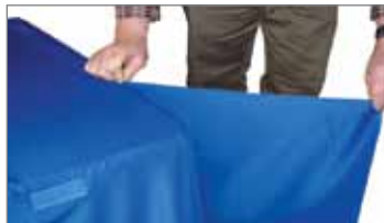
Fold and wrap the adjustable side panels around a 6 ft table or leave unfolded to fit on an 8 ft table