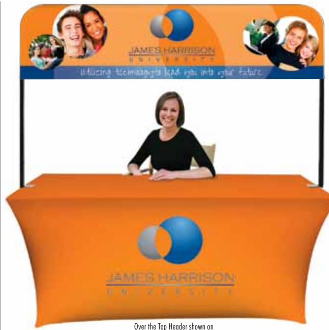
Over The Top Header shown on 8' UltraFit Table Throw