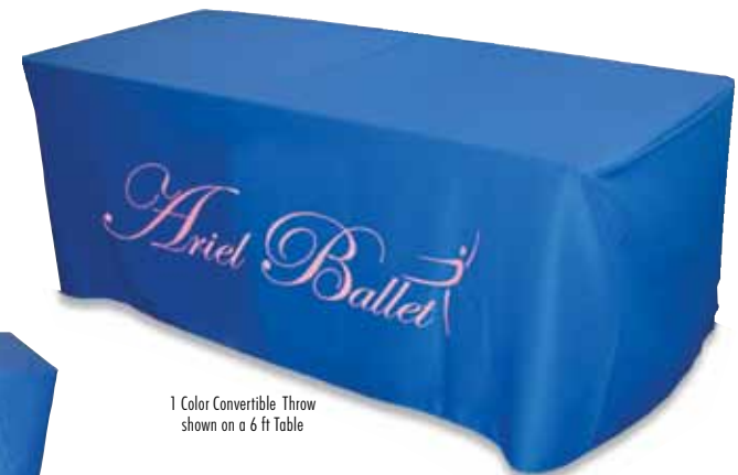
1 Color Convertible Throw shown on a 6 ft Table