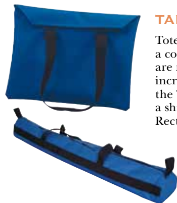
TABLE THROW CARRYING CASE

Tote your table throws, covers or runners in a convenient carrying case. Both varieties are made from vinyl-backed polyester so are incredibly durable and weather resistant. With the Tubular style, you roll the coverings over a shipping tube and slip it in the bag. The Rectangular style requires simple folding.