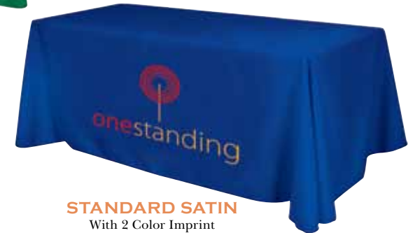
STANDARD SATIN With 2 Color Imprint