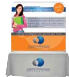
Over The Top Tall Backwall shown on 8' Standard Table Throw