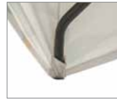
Reinforced sleeves slip under table legs to secure Poly-Stretch Throw