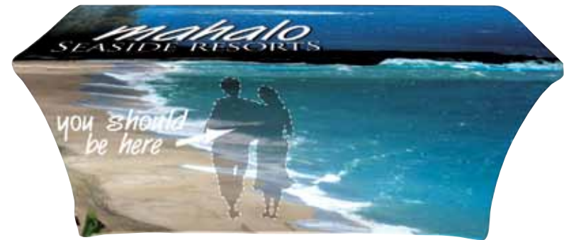
Imprinted Full Throw shown on a 6 ft Table